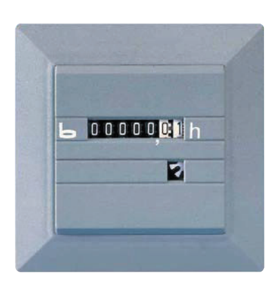
counter 48 x 48 mm, with bezel 72 x 72 mm

counter 48 x 48 mm, with bezel 55 x 55 mm