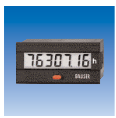
type 3800, 3810

On pages 1-7 to 1-11 you will find variants with signal- or relay output or with two permanent indications. Voltage-free counters, which operate with a lithium battery, will be shown on page 1-6 and module solutions are specified in register 3.