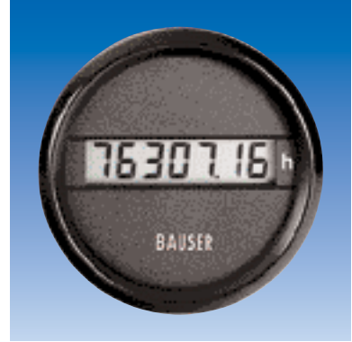
type 3802, 3812