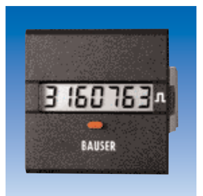
type 3801, 3811