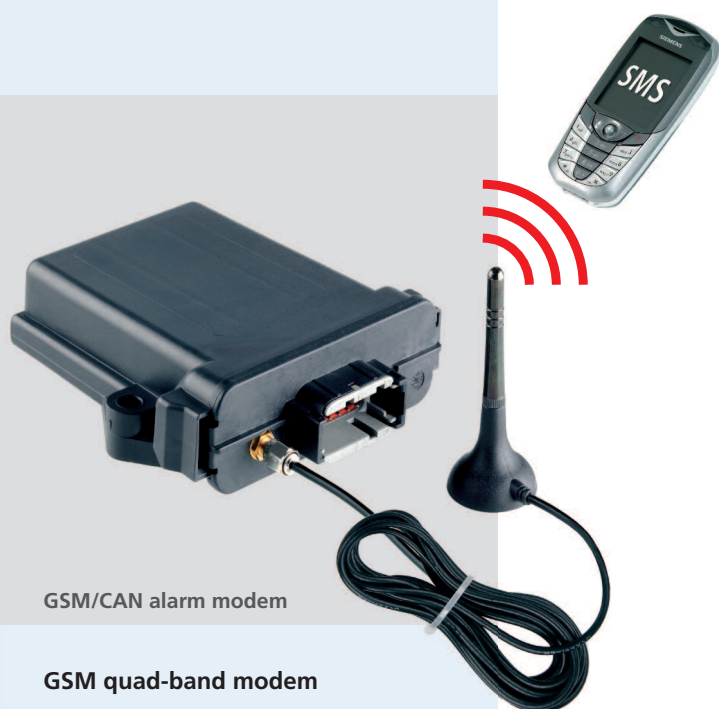
GSM/CAN alarm modem