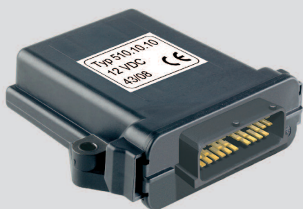
I/O module with CANbus interface, or with PWM output